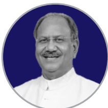
Shri Brijmohan Agrawal Member of Parliament Lok Sabha, Raipur